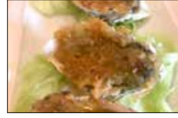
Garlic Butter Oyster