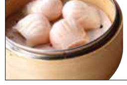
Shrimp Crystal Dumpling