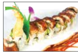
Eel Lover Roll