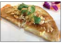
Thai Crab Cake

🚩 Hot & Spicy | Any substitutions & brown rice will be extra charged