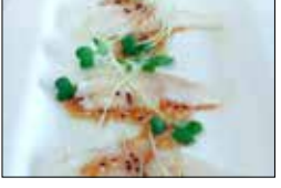
New Style Sashimi