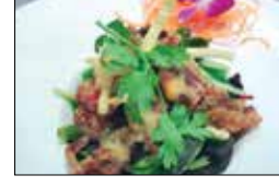
Garlic Soft Shell Crab