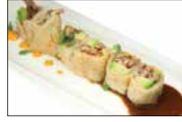
Crispy Ginger Duck Roll