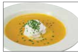
Butternut Squash Soup

If you have a food allergy, please speak to the manager, chef or your server. Consuming raw or undercooked meats, poultry, seafood, shellfish, or egg may increase your risk of foodborne illness, especially if you have certain medical conditions