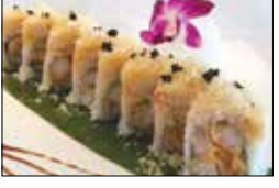
Dancing Rock Shrimp Roll