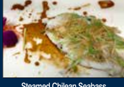
Steamed Chilean Seabass