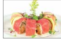
Deluxe Rainbow Roll