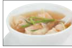
Aria Special Dumpling Soup