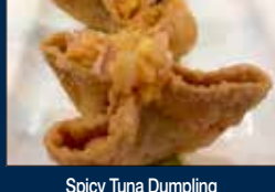
Spicy Tuna Dumpling