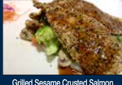
Grilled Sesame Crusted Salmon