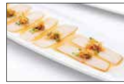
Truffle White Tuna