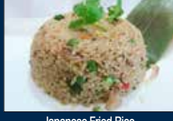
Japanese Fried Rice