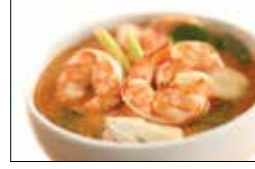
Tom Yam Soup