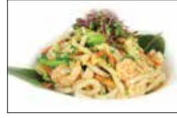
Shrimp Yaki Udon Noodle