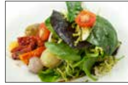
Tomato Avocado Salad