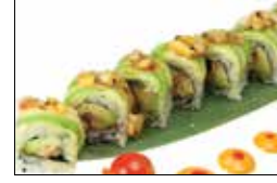
Panko Crusted Shrimp